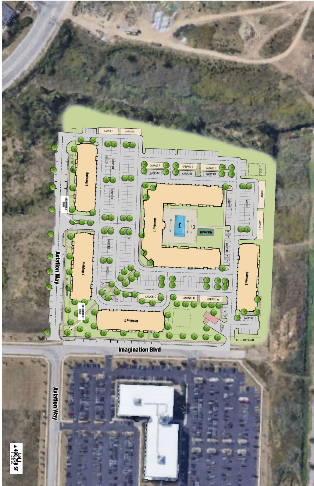
EXHIBIT B PRIVATE IMPROVEMENTS