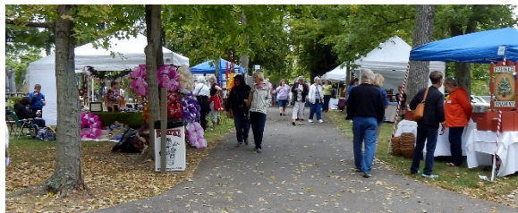
A view of the 2015 art fair.

To sign up or receive additional information contact Scott Osterfeld at sdosterfeld@butlerdd.org or 513-785-2813.